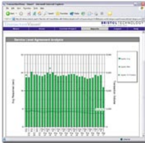
Service Level Agreement Analysis

Corda's software allows TransactionVision's business users to see trends and exceptions, and allow them to take action immediately. This allows decision makers to drill down into the vital details of the data to identify what happened, where it happened and when it happened. This empowers managers and executives to make decisions to nip the problems in the bud.