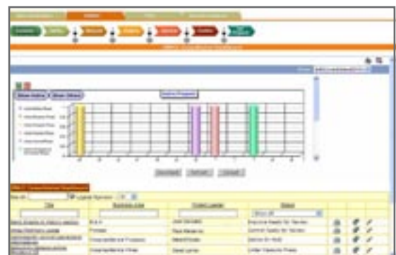
Example of a real-time Six Sigma process dashboard in Orchestra with a list of projects, and their current states in the project funnel. PopChart is used to display the status of active and other projects.