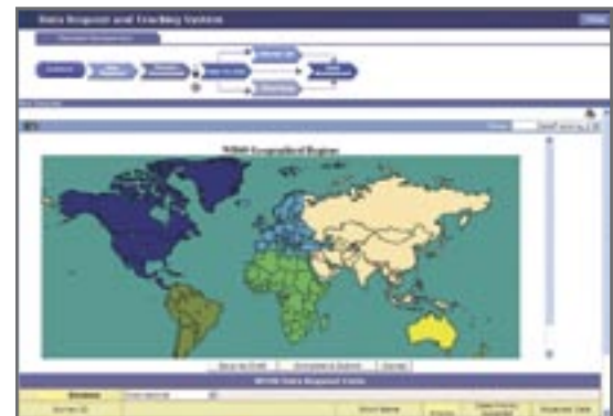
A drilldown dashboard for a funnel-based data request and tracking system in Orchestra. OptiMap is used to provide a geographical interface for easy selection of countries and associated assets, and Orchestra automates the population of data fields in the Data Request form based on the selected items.

Many of PointCross’ clients who use Orchestra are in the oil, energy and mining business, including Shell EPB and BHP Billiton. For example, many Energy and Petroleum (E&P) companies routinely develop and assess opportunities for the investment and growth of their portfolio value. Orchestra provides a “closed loop” E&P management system that propels regional and thematic strategies to drive budgets and controls on the processes that can turn opportunities into assets, while providing data and information feedback that drive portfolio and strategic decision making processes.